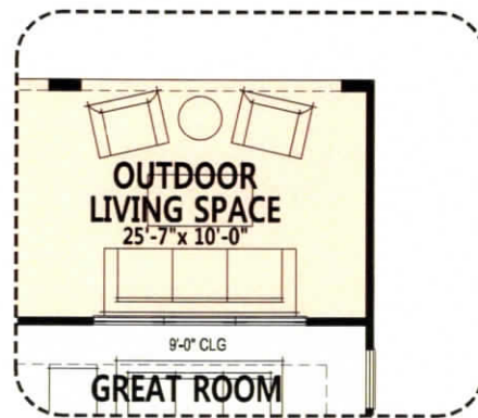
Opt. Privacy Wall

At Robson Ranch Texas, you can personalize your home...your way with a variety of options and features.