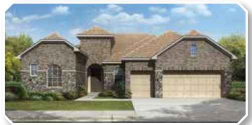
Exterior Design D