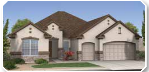
Exterior Design C