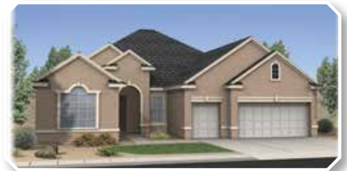
Exterior Design A