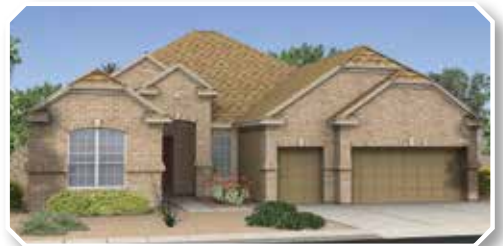
Exterior Design B